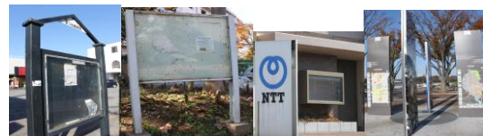
Photos show the different shapes and patterns of notice boards