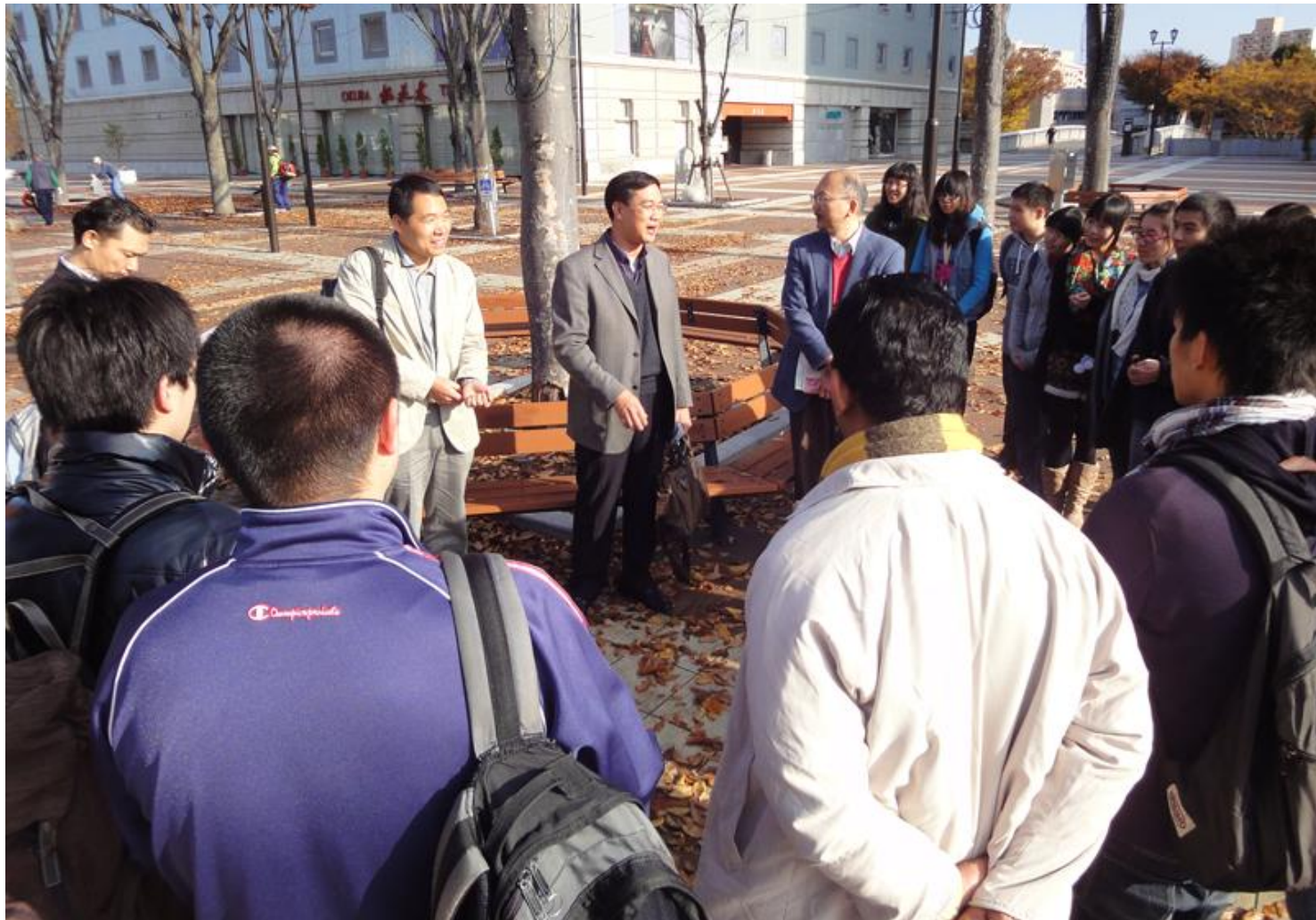
Participants from China