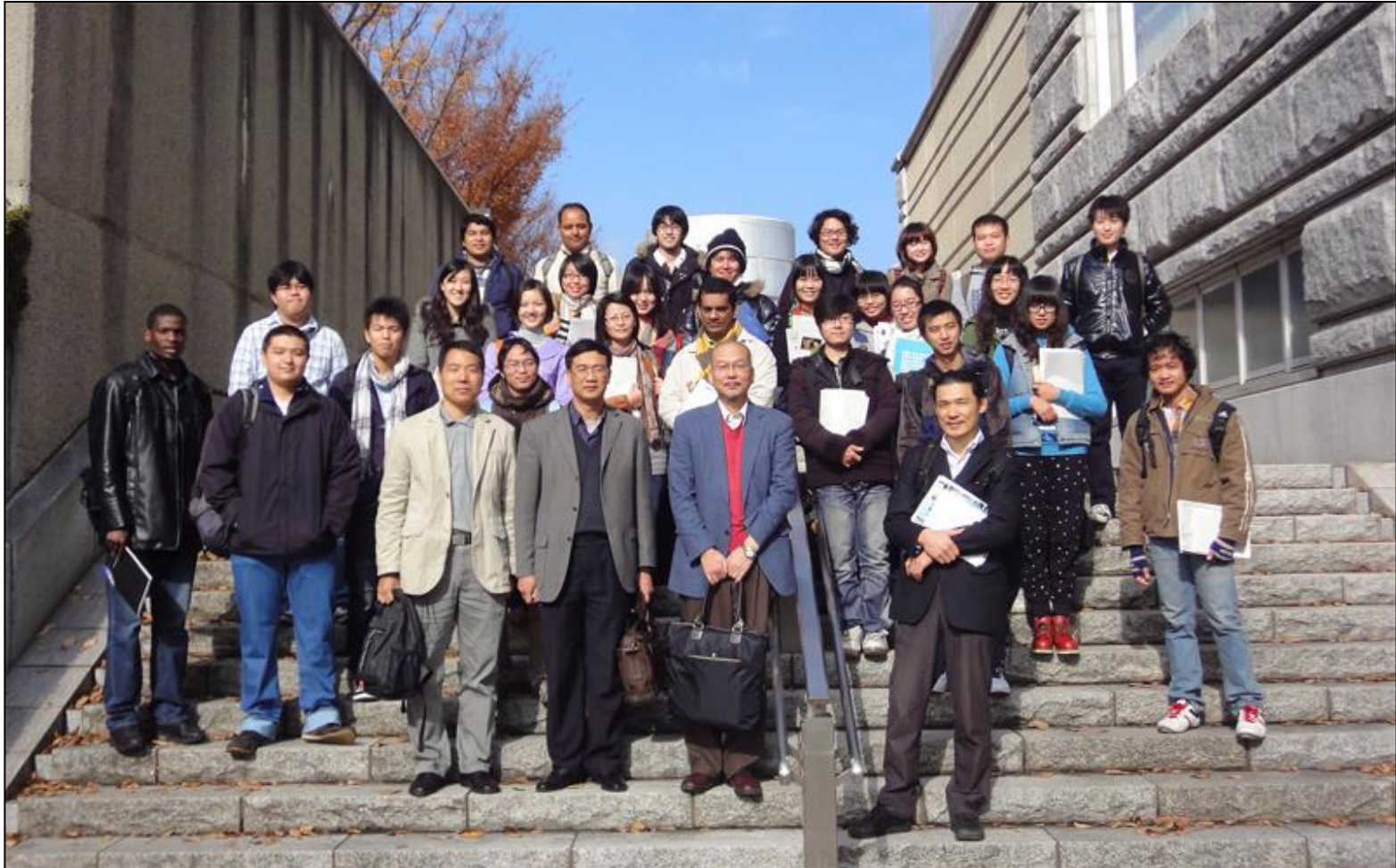
2010 SIS Field Work Class participants: Four faculty members and sixteen students from University of Tsukuba, Japan and two faculty members and nine students from South China Normal University, China. 2010.11.27