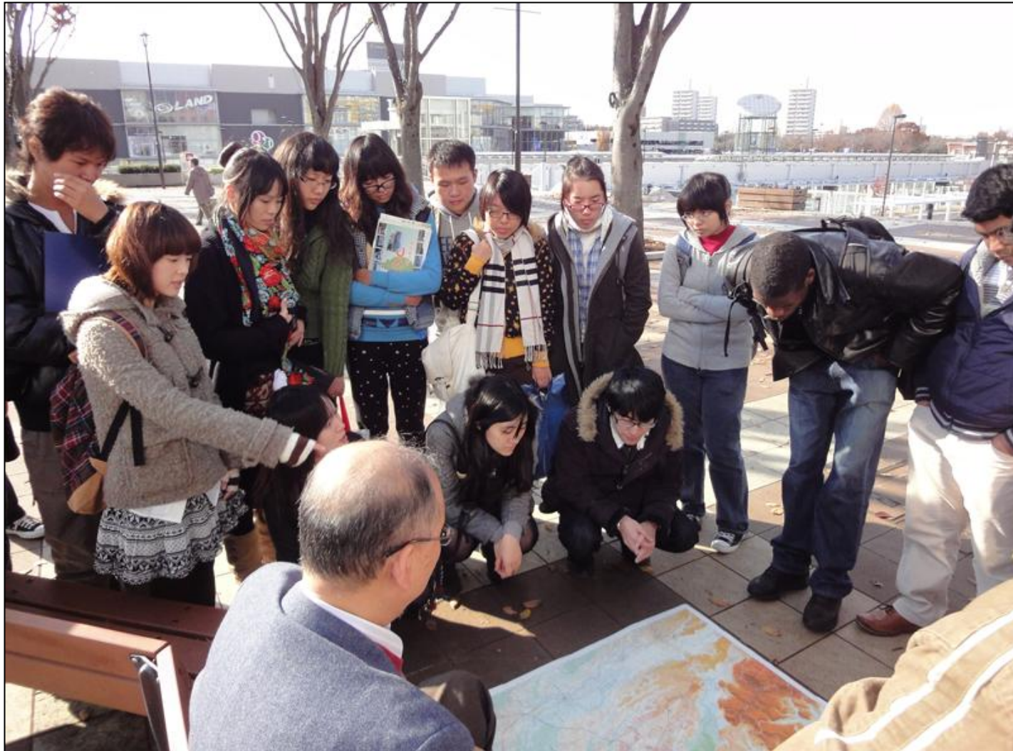
Start field work (Planning routes)