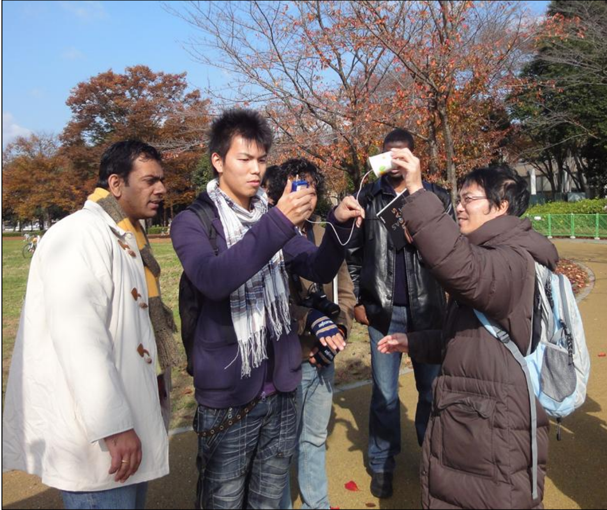
Portable temperature measurement