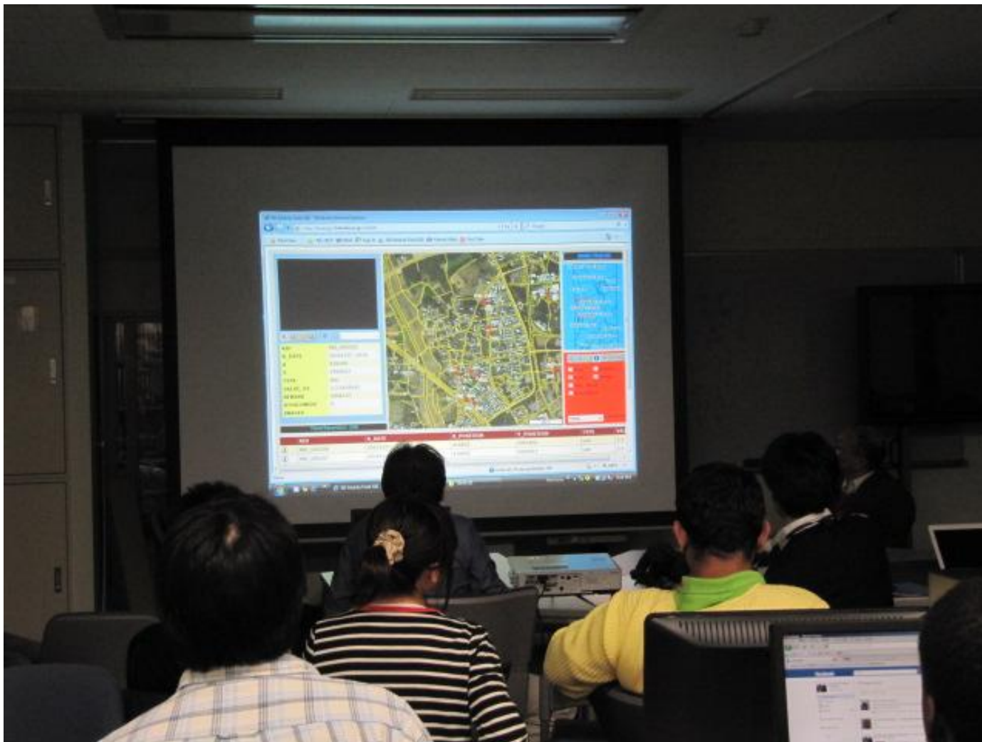
After field work: Data checking for individual field work