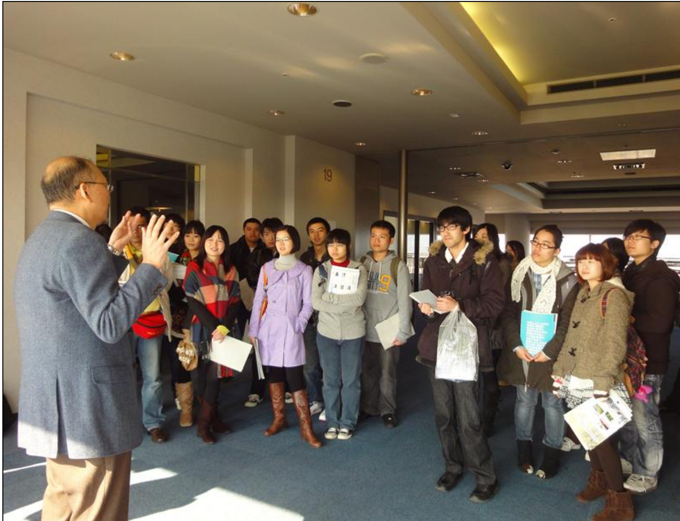
Explanation about Tsukuba City landscape structures from the high-rise building .... (Spatial perspective)