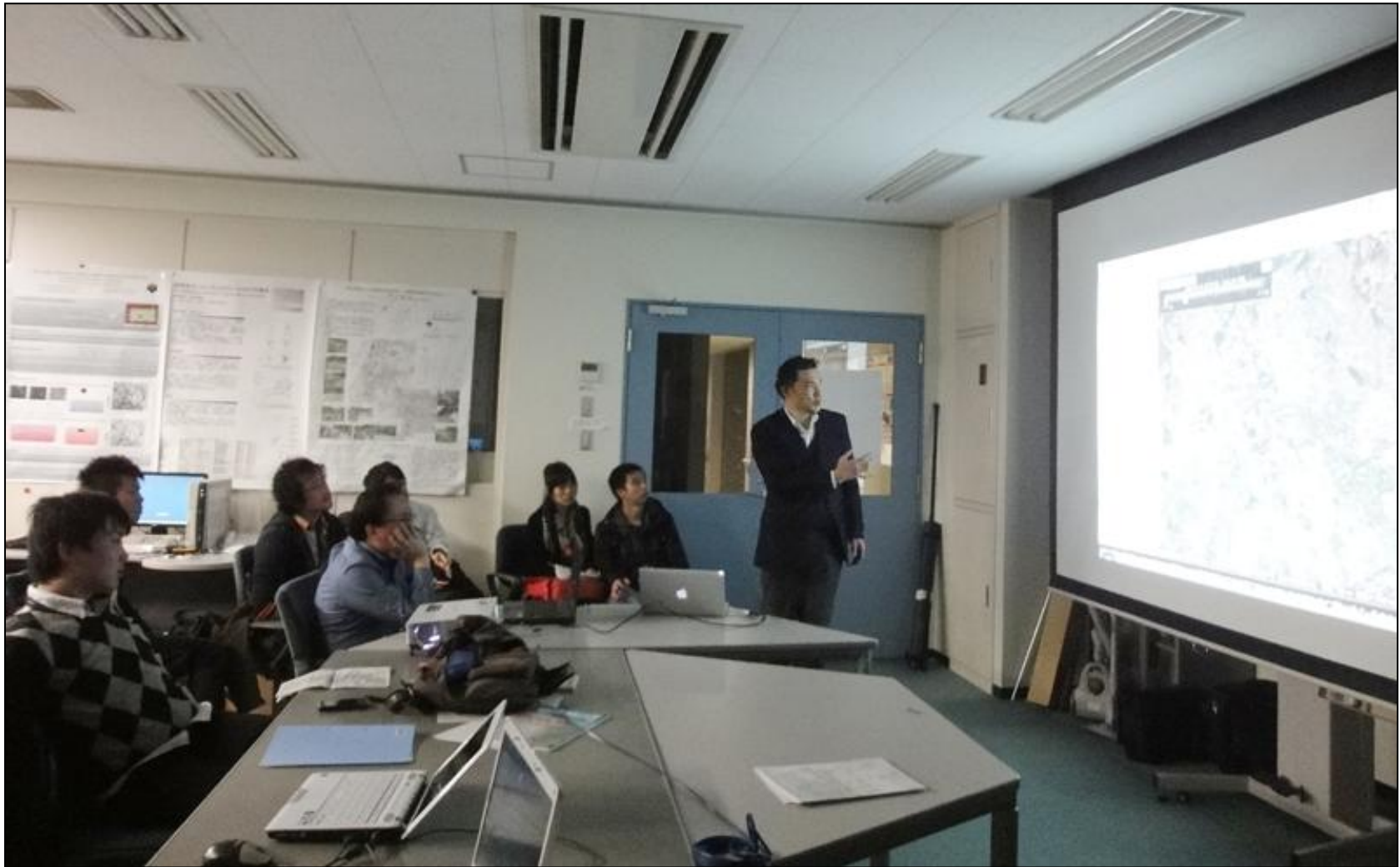
After field work: GPS tracking and waypoints analysis