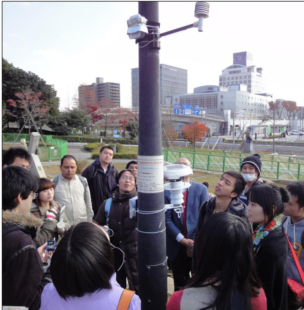
Explanation about automatic meteorological data collection system