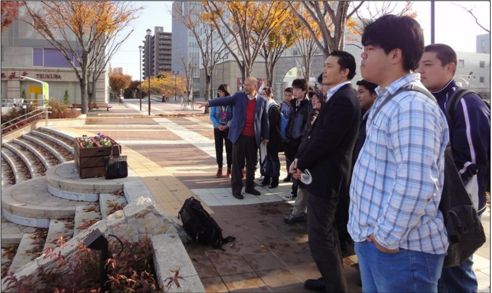
Explanation about Tsukuba City landscape structures