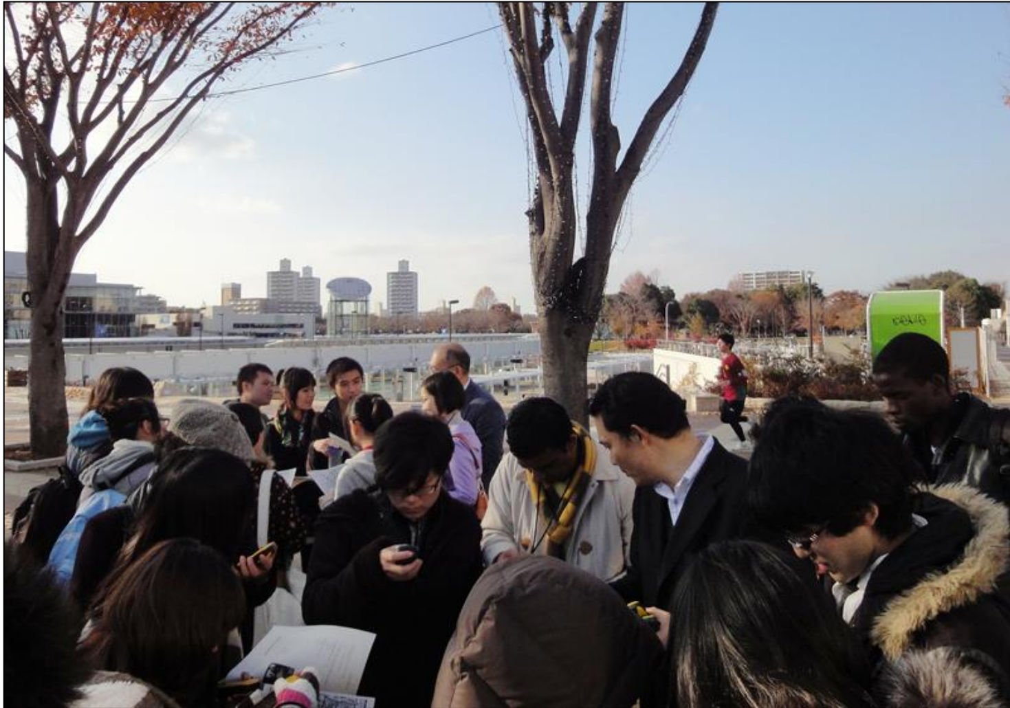
GPS training and field data collection