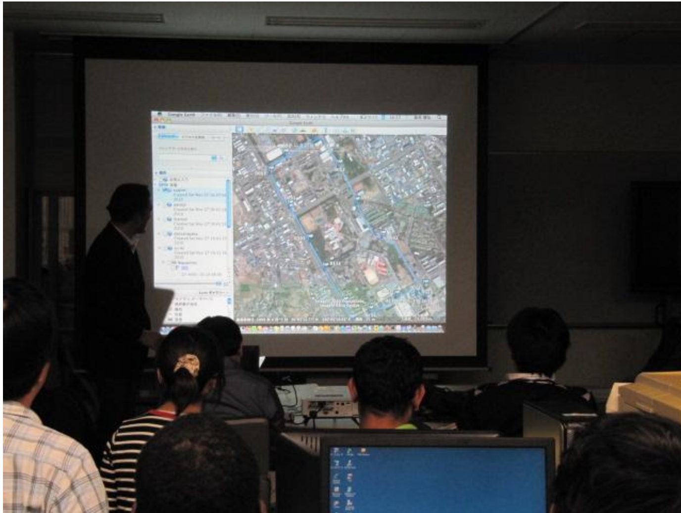
After field work: GPS tracking and waypoints analysis in Google Earth