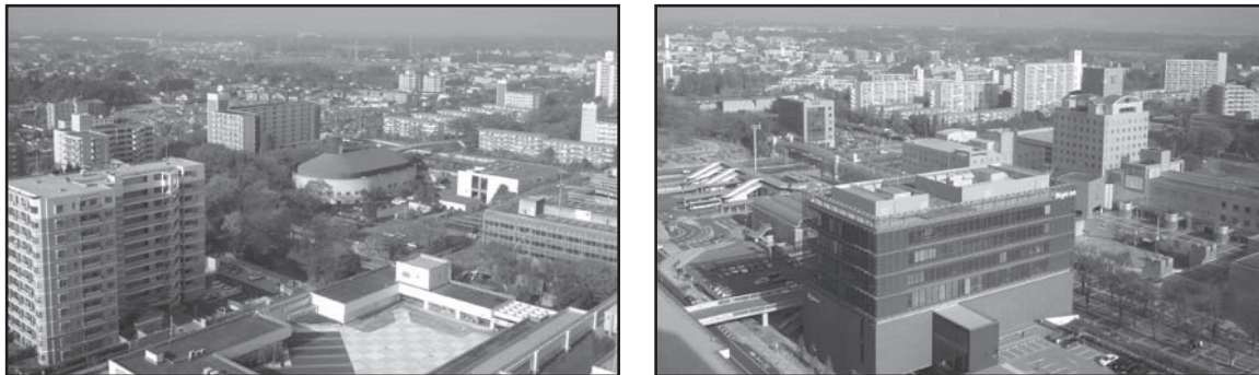
Fig. 2 Living environment of Tsukuba: West-North (left) and North (right) area.

As we agreed with the studies of de Vries et al. (2003), Maas et al. (2006), Tyrvaenen et al. (2007), and Sugiyama et al. (2008) on urban greenery plays important role in residents health. To determine the density of green on a patch of land, we must observe the distinct colors (wavelengths) of visible and near-infrared sunlight reflected by the plants. The pigment in plant leaves, chlorophyll, strongly absorbs visible light especially in red region of wavelength for use in photosynthesis. The cell structure of the leaves, on the other hand, strongly reflects near-infrared light (from 0.7 to 1.1 \mu\text{m} ). The more leaves a plant has, the more these wavelengths of light are affected, respectively. The AVNIR2 sensor onboard in ALOS records the spectral reflectance in three visible bands and one infrared band (Thapa and Murayama, 2009) where two bands 3rd and 4th refer to Red and Infrared, respectively. Therefore, a numerical ratio between these