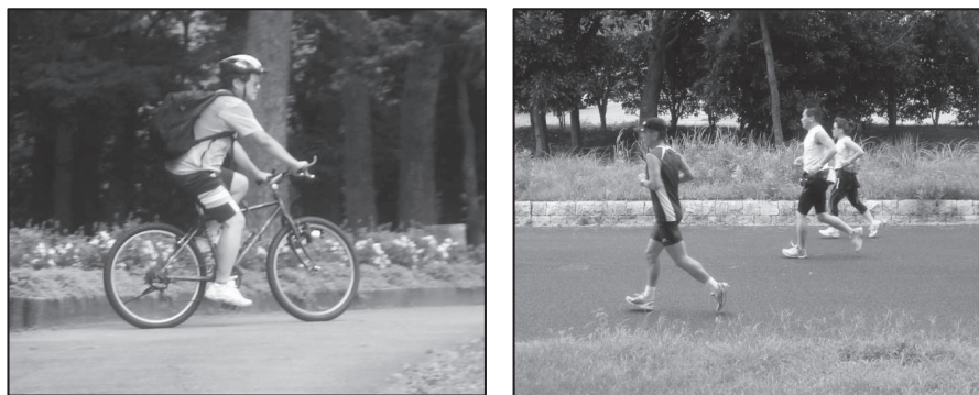
Fig. 1 Walkability in Tsukuba (9 August 2009).

Walkability is being measured from a variety of angles and their results are delivered in various ways, mostly in static maps and community voices. Rapidly growing area of urban form research concerns how to measure the level of walkability of neighborhoods and make aware of it to residents in the area. Many scholars and planning practitioners have already examined many components of the land use-transportation connection and built environment-physical activity link (Stevens, 2005). However, very few have examined walkability at street level using GIS (Forsyth et al., 2007) and delivered the results in different forms of web system. This article aims at examining walkability areas in Tsukuba and presents the outcomes creating Walkability WebGIS. Remote sensing